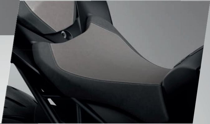
MAIN SEAT (ALCANTARA)