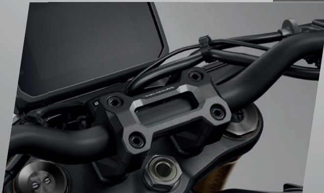
HANDLE HOLDER UP