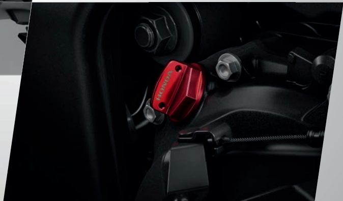
OIL FILLER CAP