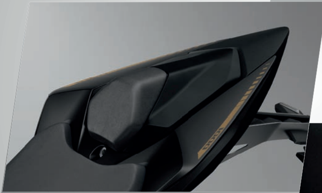
SEAT COWL BLACK