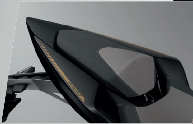
PILLION SEAT (ALCANTARA)