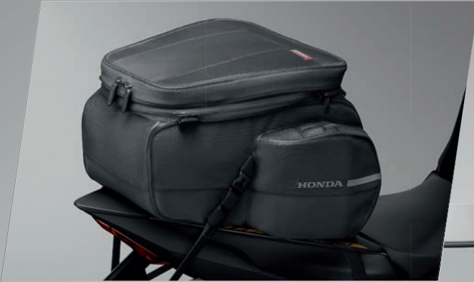
REAR SEAT BAG